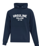
Approximate size, color, and positioning

Looking for new UCC Spirit Wear? Check out our UCC on-line store at shopgp.online/ucc