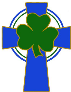
St. Patrick's Catholic High School

Participate in our DRIVE-BY NON-PERISHABLE FOOD COLLECTION: On Saturday December 4th, 2021 from 9am-12noon drive into our school parking lot where students will receive your donations and load them onto the St. Vincent de Paul van so we can restock the food bank supplies.