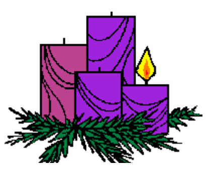
1st Sunday of Advent