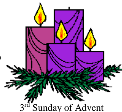
3 rd Sunday of Advent

Have a Very Merry Christmas and a Most Blessed New Year!