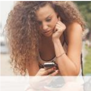
Anxiety and Mindfulness