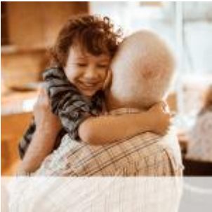
Enjoy the Holidays More With Mindfulness