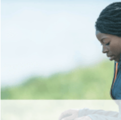
The Art and Science of Mindfulness