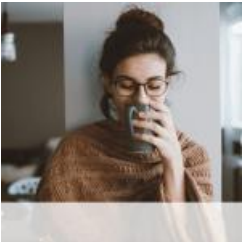
How Mindfulness Can Help Caregivers