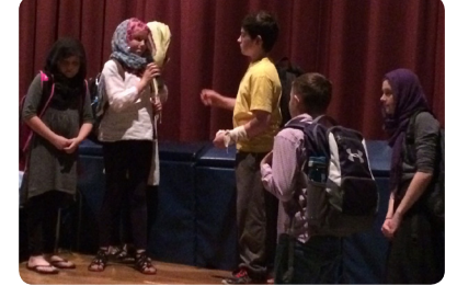
Students perform the play "Run, Hide, Survive" about the plight of refugees.