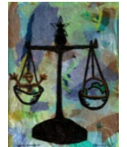
A Responsible Citizen